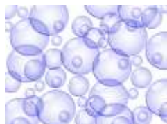
Min. of Discipleship Youth

SOAP makes lots of bubbles. It also Saves Our Adolescents from Prostitution.