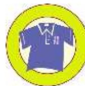
Wear Your CTK Apparel!

Everyone is encouraged to wear Ctk apparel, including gold "God's work. Our hands." or Thrivent t-shirts, to worship on Rally Day weekend - September 8th & 9th. The name tag board will be in the narthex to remind us that we are called to Shine the Light of Jesus.