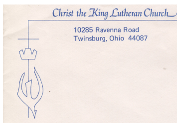
Christ the King letterhead from early 1980's.

One property highlight of 1982 was the installation of a security light on the back of the building, and there were indications that the roof would have to be replaced soon! In 1982 the choir retired its old green robes for brand new brown robes.